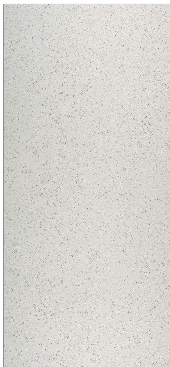
Iced White 1.5CM Quartz Polished 1.5CM QSL-ICEDWHT-1.5CM