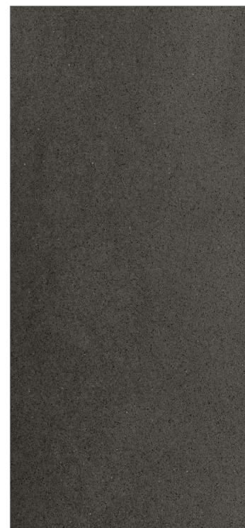
Manhattan Gray 1.5CM Polished 1.5CM QSL-MANHATGRY-1.5CM