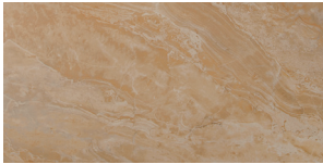
Onyx Sand 16"x32"