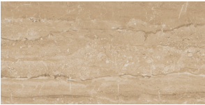
Dunes Beige 16"x32"