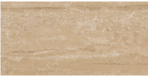
Dunes Beige 16"x32"