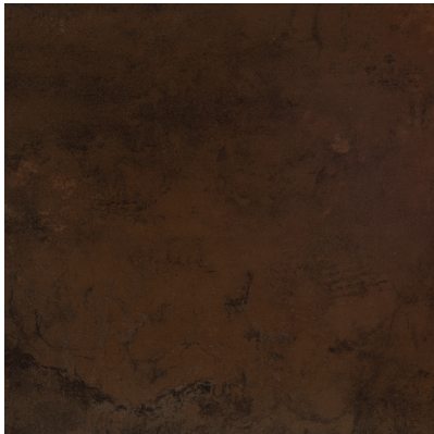
Jupiter Iron 20"x20"