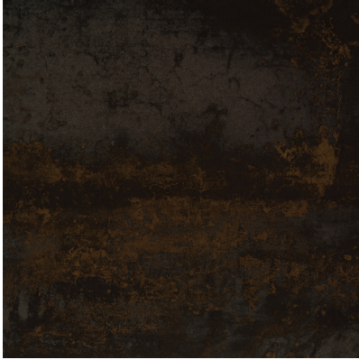
Saturn Coal 20"x20"