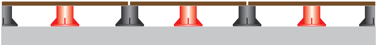
Cross section of center pedestal applied underneath pavers.