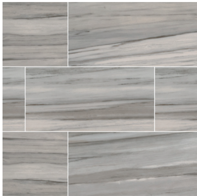
Asturia Azul 12"x24"