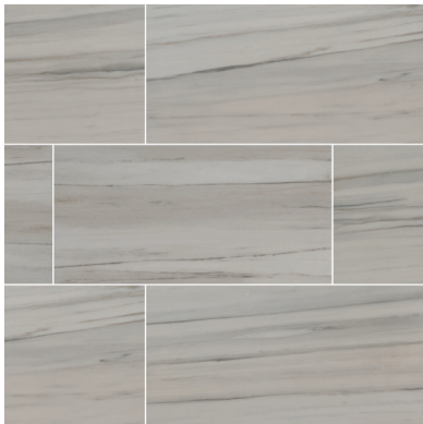
Asturia Cielo 12"x24"