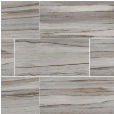
Asturia Fuoco 12"x24"