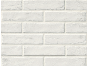
Capella White 2 1/3" x 10"