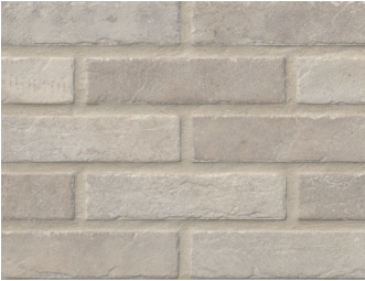
Capella Ivory 2 1/3" x 10"