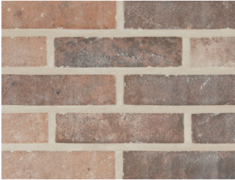
Capella Red 2 1/3" x 10"