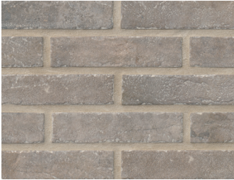
Capella Taupe 2 1/3" x 10"