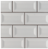
3"x6" Inverted Beveled