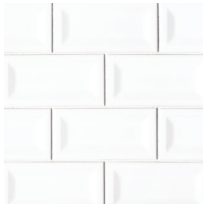
3"x6" Inverted Beveled