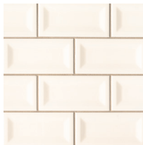
3"x6" Inverted Beveled