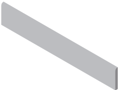
3" x 6" Bullnose 4" x 16" Bullnose