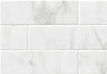
White Carrara 4"x16"