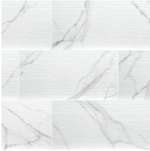
Statuary Stripe White 12"x24"