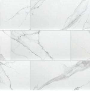
Statuary White 12"x24"