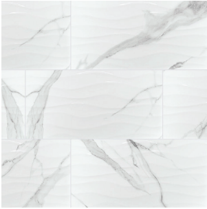
Statuary Wavy White 12"x24"