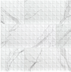
Statuary Chex White 12"x24"