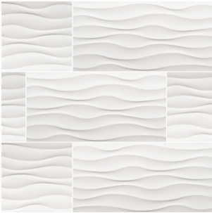
Wavy White 12"x24"