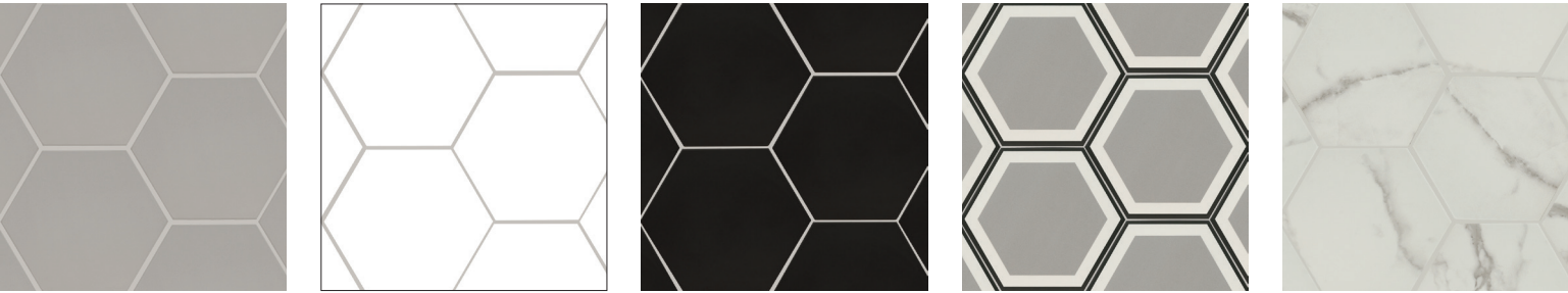
Dove 9"x10.5" Ecu 9"x10.5" Graphite 9"x10.5" Hive 9"x10.5" Marbello 9"x10.5"