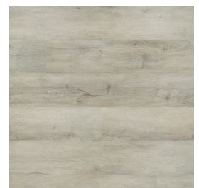
YORK GRAY VTGYORGRA9X48-5MM-20MIL