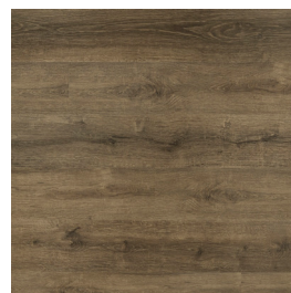
WALNUT WAVES VTGWALWAV9X48-5MM-20MIL