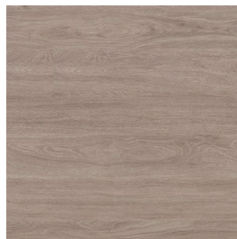
BLEACHED ELM VTGBLEELM9X48-5MM-20MIL