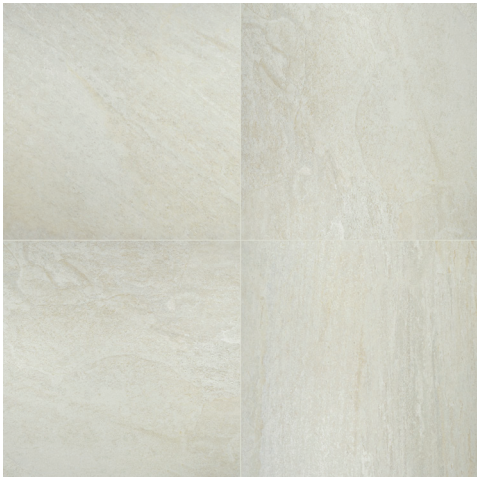
Quartz White 24"x24"