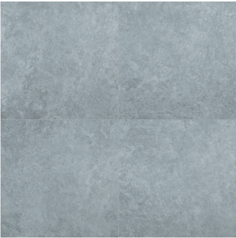
Lunar Silver 24"x24"