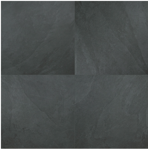
Montauk Black 24"x24"