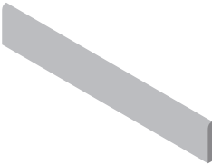
3" x 18" Bullnose

Large format tiles: It is mandatory that the mortar coverage on the floor surface and tile be greater than 95% coverage to be fully supported. Voids due to insufficient coverage will result in cracking and tile displacement.