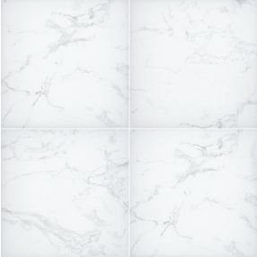
Carrara Paver 24"x24"