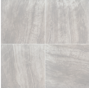
Grey Paver 24"x24"

Designers are Buzzing The transitional living trend is here to stay, so here's the green light to start planning your dream space with MSI's industry-leading indoor-to-outdoor porcelain tile collections.