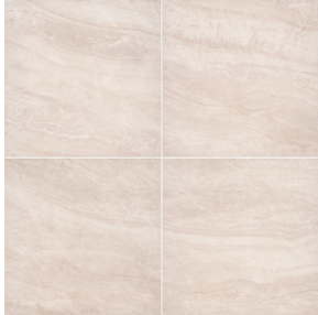
Crema Paver 24"x24"