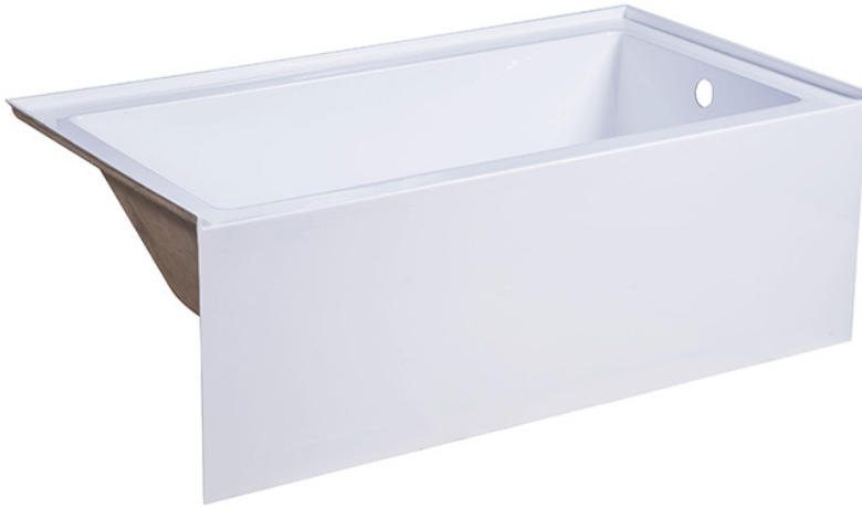
3 Sided Alcove Flange Size: 60" x 30" x 21 5/8"