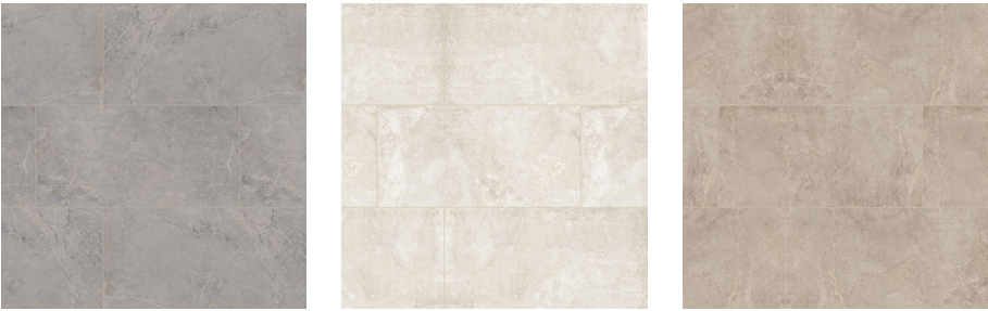
Grigio Ivory Taupe