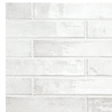
LA PERLA NSTELAPEA2X10G