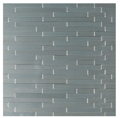
Silverina Interlocking 5mm