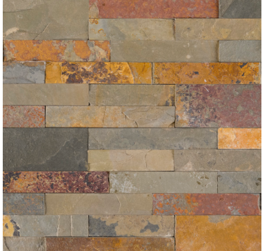
Gold Rush Peel And Stick Stacked Stone