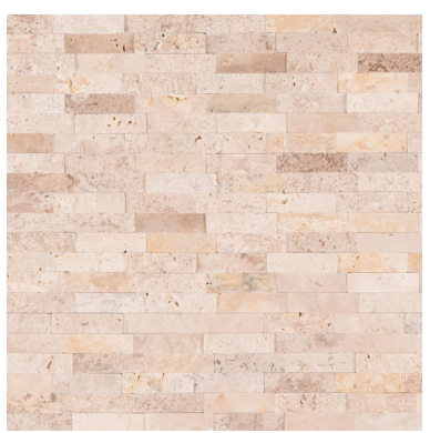
Roman Beige Splitface Peel And Stick