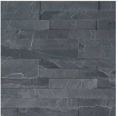
Midnight Ash Peel And Stick Stacked Stone