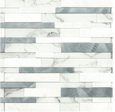
Denali Frost Interlocking Peel And Stick