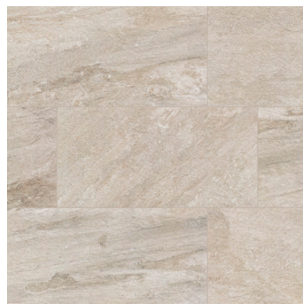
STOWE DESERT AMBER NSTODESAMB2448

The Traktion Stowe Collection brings the timeless beauty of natural slate-look porcelain to any space with two versatile color options: Desert Amber, a warm beige with earthy undertones, and Silver Dune, a cool white with elegant gray striations. Designed for both interior and exterior applications, this durable and highly water-resistant tile is enhanced with MSI's innovative ZeroSlip™ technology, ensuring superior slip resistance even when wet. Available in matte-finished 15" x 30", 24" x 48", and 2" x 2" mosaic options, Traktion Stowe is the perfect choice for floors, walls, patios, walkways, and more in residential and commercial settings.