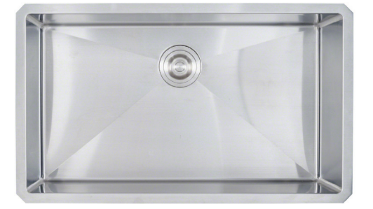
SIN-16-SINBWL-WEL-3219 Outside - 32"x19" • Inside - 30"x17" Depth - 10" • Minimum Cabinet - 36" 1 Strainer and Grid included *Also available in 18 Gauge