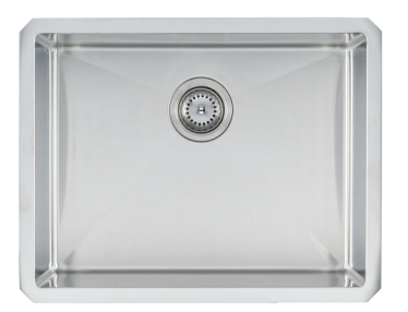
SIN-16-SINBWL-WEL-2318 Outside - 23"x18" • Inside - 21"x16" Depth - 10" • Minimum Cabinet - 27" Matching Grid Available