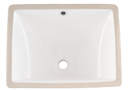
SIN-POR-UNDRECWHT-2015 Outside - 20 <sup>3</sup>/8"X15 <sup>1</sup>/8" Inside - 18 <sup>1</sup>/8"X13" Depth - 7 <sup>5</sup>/8"