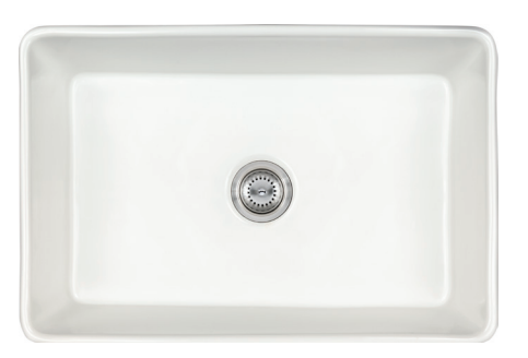
SIN-POR-USBWH-3020FSAF Outside - 30X19 <sup>3</sup>/4" Inside - 29 <sup>1</sup>/4" X18 <sup>3</sup>/4" Depth - 8 <sup>1</sup>/2"