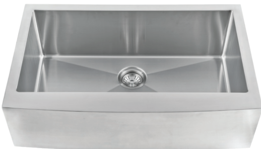
SIN-16-SINBWL-WEL-3321FSAF Outside - 32 <sup>7</sup>/<sub>8</sub>"x20 <sup>3</sup>/<sub>4</sub>" • Inside - 30 <sup>7</sup>/<sub>8</sub>"x18 <sup>3</sup>/<sub>4</sub>" Depth - 10" • Minimum Cabinet - 36" Matching Grid Available