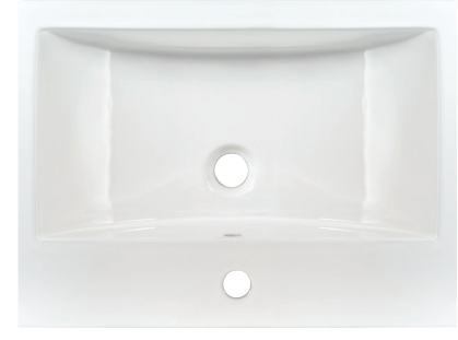
SIN-POR-VOMRECWHT-2417 Outside - 24"x17" Inside - 21"x11" Depth - 7 1/2"