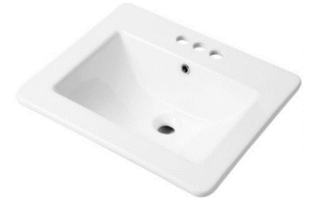
SIN-POR-VOMRECWHT-2118 Outside - 21 <sup>1</sup>/<sub>4</sub>"x17 <sup>1</sup>/<sub>8</sub>" Inside - 16 <sup>3</sup>/<sub>8</sub>"x11<sup>3</sup>/<sub>8</sub>" Depth - 7 <sup>3</sup>/<sub>8</sub>"