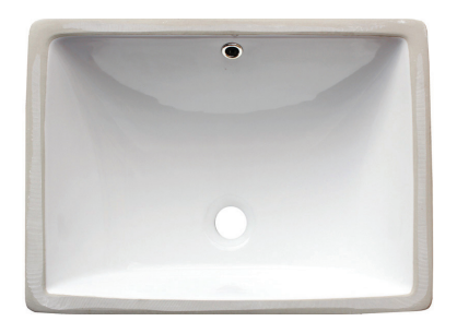
SIN-POR-UNDRECWHT-1813 Outside - 18 <sup>1</sup>/2"X13 <sup>3</sup>/4" Inside - 16 <sup>1</sup>/2"X11 <sup>3</sup>/4" Depth - 8"