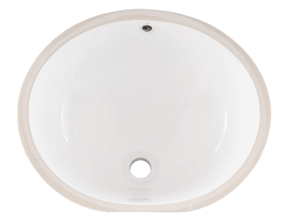
SIN-POR-UNDOVLWHT-1714 Outside - 19 <sup>1</sup>/<sub>2</sub>"X16" Inside - 17 <sup>1</sup>/<sub>2</sub>"X14 <sup>3</sup>/<sub>8</sub>" Depth - 8 <sup>1</sup>/<sub>8</sub>"