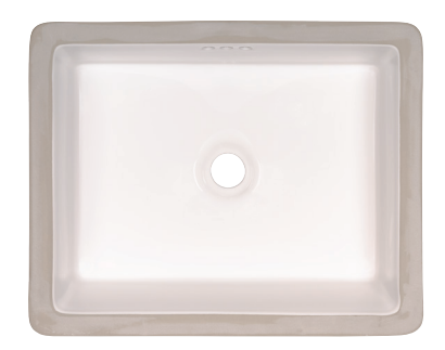
SIN-POR-VURWH-2015FL Outside - 19 <sup>3</sup>/4"X15 <sup>3</sup>/4" Inside - 17 <sup>1</sup>/4" X13 <sup>1</sup>/4" Depth - 7 <sup>1</sup>/8"