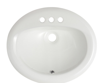
SIN-POR-VOMOVLWHT-2118 Outside - 20 1/2"x17 11/16" Inside - 16"x11 3/16" Depth - 7 7/8"