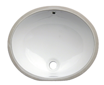
SIN-POR-UNDOVLWHT-1512 Outside - 17"X14 <sup>1</sup>/8" Inside - 15"x12" Depth - 7 <sup>3</sup>/4"