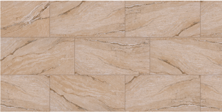
Vezio Beige Matte