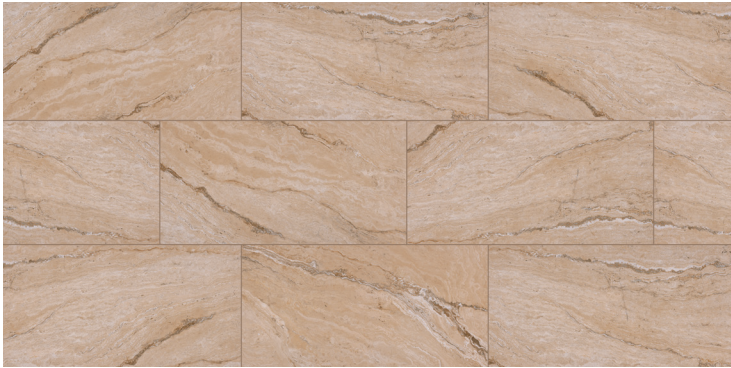
Pietra Vezio Beige Polished