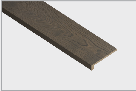
EASED EDGE STAIR TREAD 11.25" x 0.63" x 48"