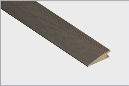
REDUCER 2" x 0.48" x 78" / 2.25" x 0.61" x 78"