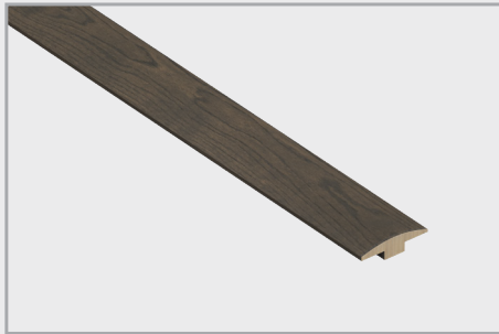
T MOLDING 2" x 0.25" x 78"