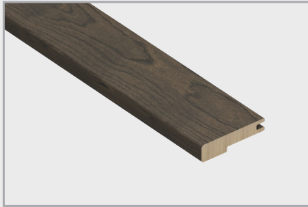
EASED EDGE STAIRNOSE 3" x 0.82" x 78"