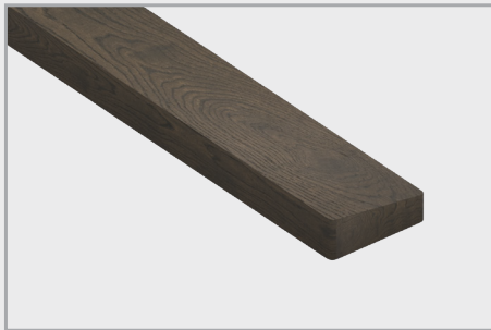
STAIR TREAD RETURN 1.85" x 0.75" x 14.75"