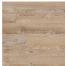
Lime Washed Oak